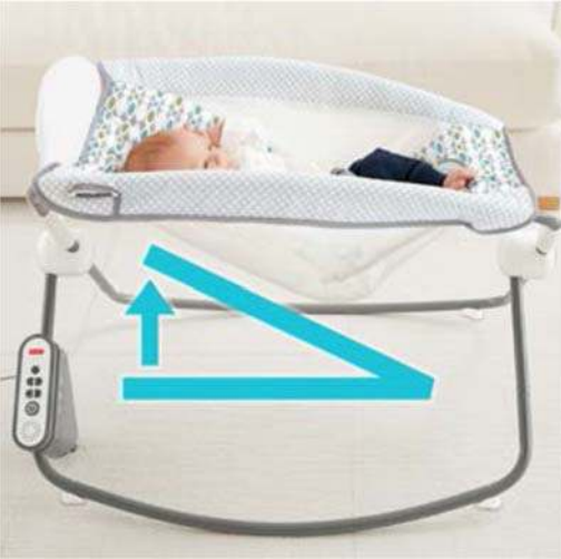
Above: Figure 2