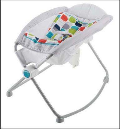
Above: Figure 1