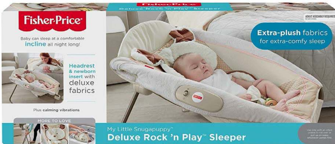
Above: Figure 6

96. One of the principal means of in-store advertising is the box in which the product is packaged. The boxes prominently tout that the product is suitable for all-night sleep as illustrated by the figures below showing typical packaging: