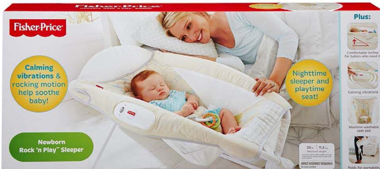
Above: Figure 7