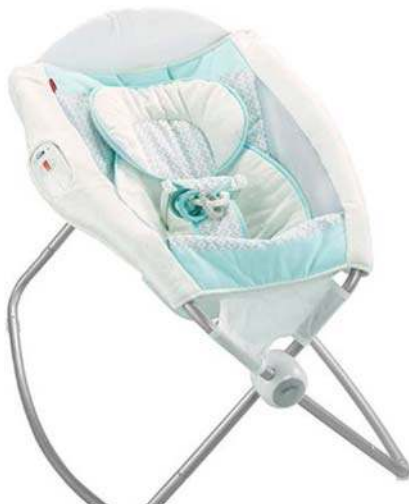
Above: Figure 5

33. Some “Premium” and “Deluxe” models, such as the deluxe model immediately above, have additional padding around the head.