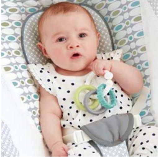
Above: Figure 3