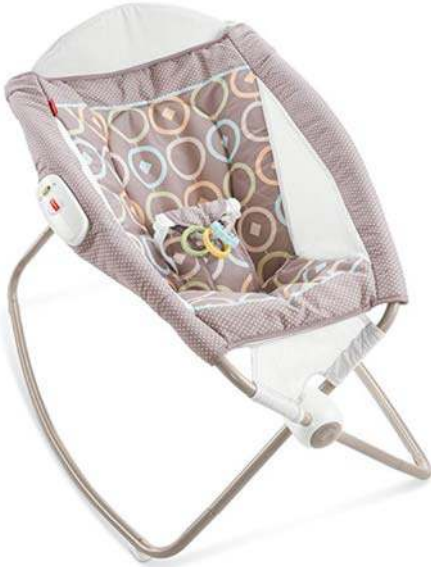
Above: Figure 4