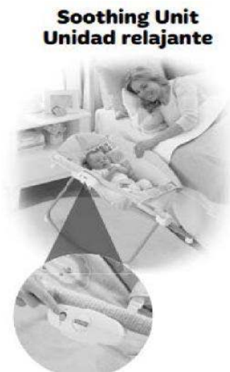
Above: Figure 11

129. The manuals are also misleading beyond the inadequate and misleading warning section. For example, the manuals show images of mothers lying down in bed, covered with blankets, which indicates either that they are ready for sleep or awakening from sleep. Below is an example: 54