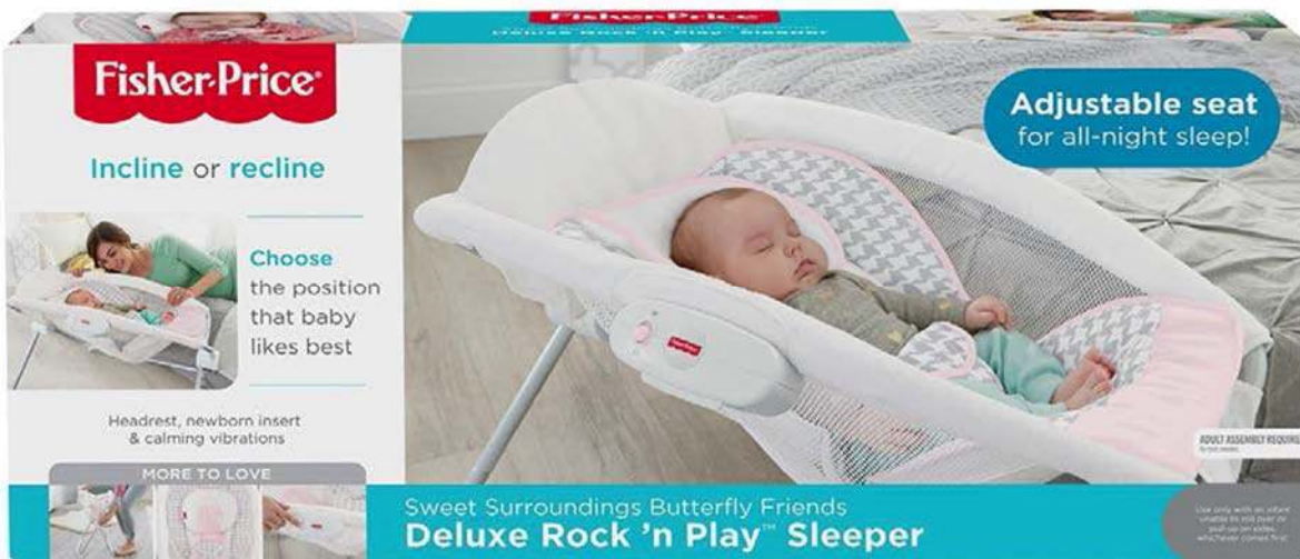
Above: Figure 8

97. The marketing statements on the packaging conflict with the AAP's guidelines and recommendations, and those of other infant sleep experts.