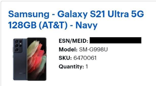
Box Exterior Sticker