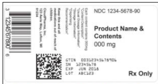
DSCSA RX Serialized Unit Label