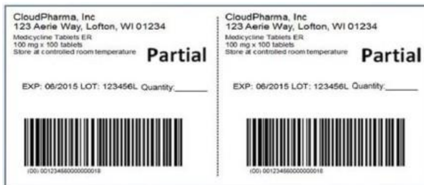
Example Partial Case Labeled with SSCC