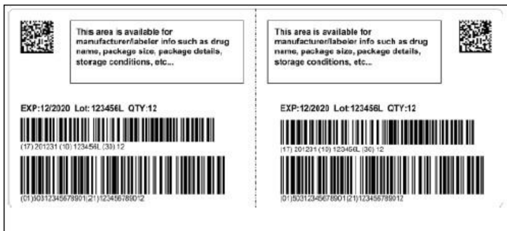
Example of Rx Serialized Homogenous Case Label