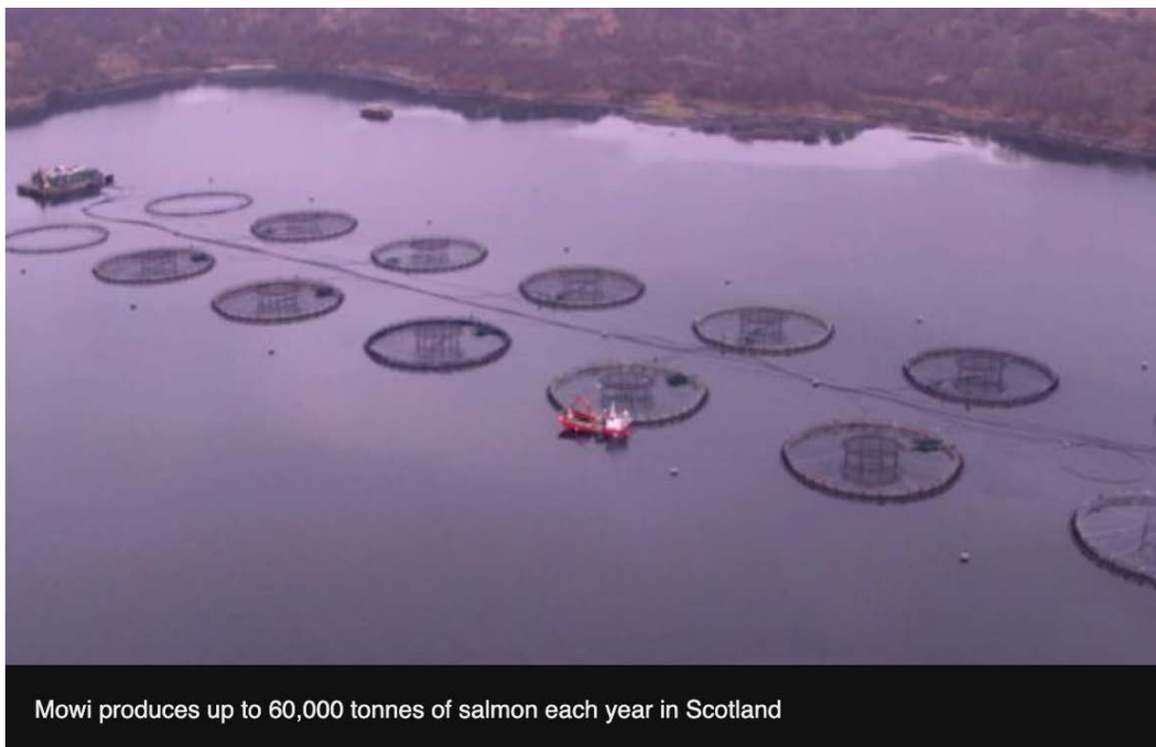
Mowi produces up to 60,000 tonnes of salmon each year in Scotland