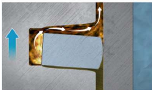
Fig. 3: Compression cycle

43. In order for the engine to run effectively and without causing engine damage, such as heat and friction wear, the pistons and cylinders require a thin film of oil between the opposing metal surfaces. The oil reduces friction and heat, prevents surface scarring, and helps the moving components slide freely past each other.