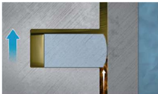
Fig. 1: Sealing through the groove side