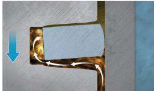
Fig. 2: Intake cycle