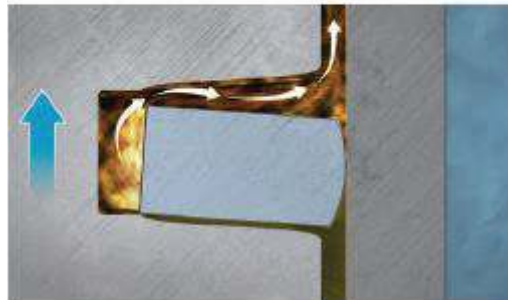
Fig. 3: Compression cycle

44. In order for the engine to run effectively and without causing engine damage, such as heat and friction wear, the pistons and cylinders require a thin film of oil between the opposing metal surfaces. The oil reduces friction and heat, prevents surface scarring, and helps the moving components slide freely past each other.