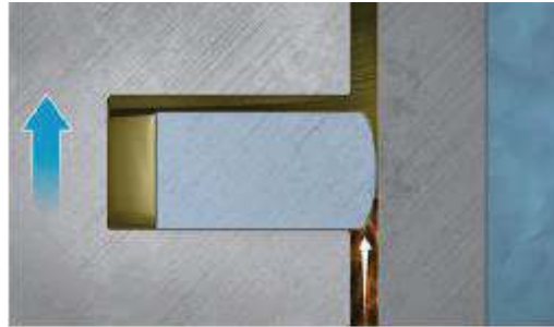
Fig. 1: Sealing through the groove side