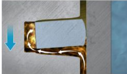
Fig. 2: Intake cycle