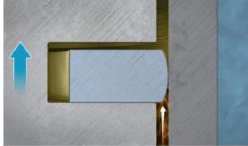
Fig. 1: Sealing through the groove side